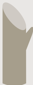
Cut at wrong angle