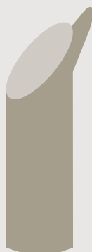
Cut too close to bud