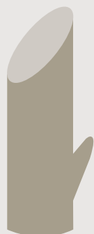
Cut too high from bud